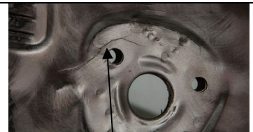
Weld up cracks

Use a body hammer to remove large gaps that may remain around the bottom edges. The use of clamps or pressing the panels together to remove gaps during welding will help give a cleaner weld.