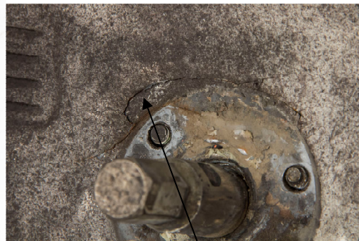
Crack at Swaybar Mount